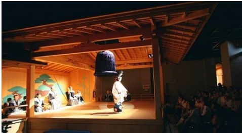
Noh performance at the Sado (Noh Village) https://www.japan-guide.com/e/e2091.html

Noh has very unique Performance elements, such as Masks, Stage, Costumes, Props, Chant and music.