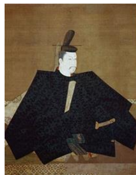
Photo 1: Lord Yori, the Commander-in-chief (1148-1199)

In Hiraizumi, Lord Yori was very impressed with mature culture in town. Temples and shrines were very prominent and statues and ornaments were colorfully decorated. Everything was new and exciting for Lord Yori. Upon return to Kamakura, he started to work on the development of his town and build temples and shrines there. In 1192, the Kamakura Shogunate was inaugurated, which was the first central government of the Samurai class in Japan.