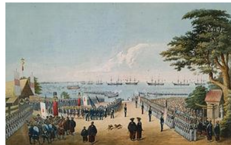
("Commodore Perry and his party landing at Yokohama to meet the Shogun's Commissioners", lithograph by Wilhelm Heine, 1855)

( http://www.kaikou.city.yokohama.jp/guide/tamakusu.html )