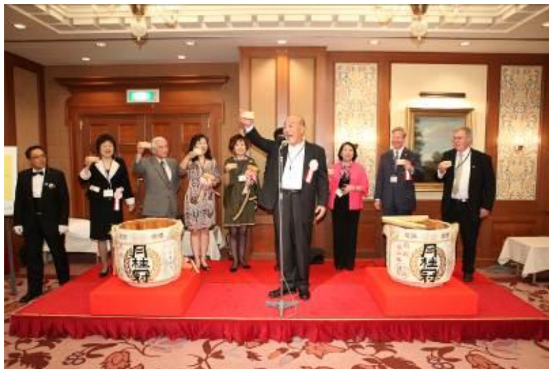
(Photo 5) Kagamiwari-performance President of AP Societies & LESI Board members