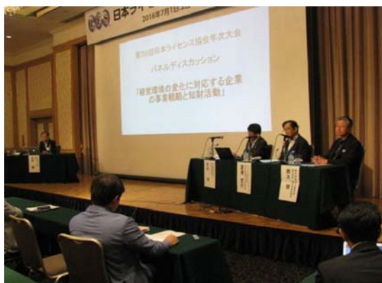
photo 12 Panel discussion

The participants were encouraged by very suggestive discussions among the knowledgeable panelists.