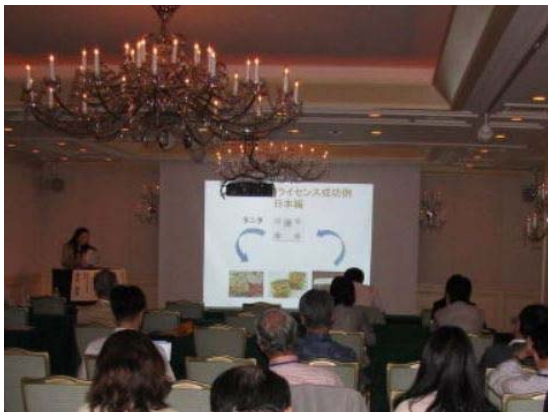
photo 11 Workshop

On the second day, five workshops (photo 11) were organized by working groups of LES Japan. Latest IP topics were discussed by: 1) Branding WG; 2) US Issues WG; 3) Healthcare WG; 4) Academia and Industry R&D Collaboration Management WG; and 5) Asian Issues WG.