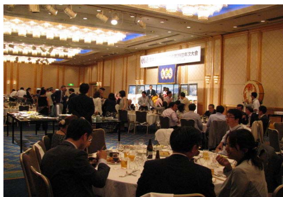
photo 8 Banquet